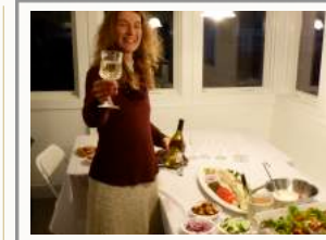
Terrific food catered by a favorite local restaurant.

The Cod Cove Inn, located in Edgecomb just off Route 1, and minutes from the lovely and scenic villages of Wiscasset, Boothbay and Damariscotta, offers accommodation at a discounted rate to participants on a first come, first-served basis, starting at $109/night. Reservations: (207)882-9586, mention DaPonte Workshop discount. Bring your spouse, who will enjoy exploring Maine’s stunning foliage and coastline while you are playing your heart out, just minutes away. The Inn is a five minute drive from the Deck House School.