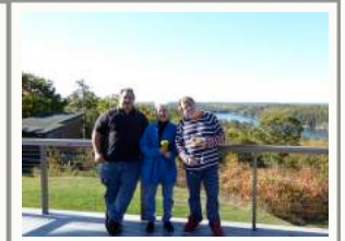
A beautiful deck allows for scenic relaxation time.