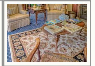
Comfortable accommodations are available five minutes away.