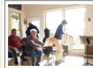
There are six comfortable rooms for rehearsal & group classes.

Located on an idyllic hill, overlooking the Sheepscot River, the Deck House School offers a secluded and comfortable setting to rehearse music. There are several rehearsal rooms, kitchen facilities and an outdoor deck. Meals for all participants will be catered by a popular local restaurant. Lodging is available for those who require it (see below) at reduced rates.