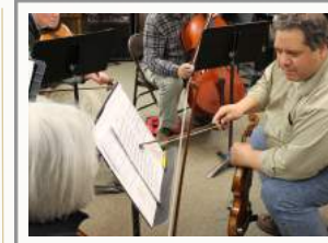
Each DSQ member will spend a few hours with each ensemble.

The workshop will begin on Friday evening with an introductory dinner for all. Coaching will be provided by individual members of the quartet in a round robin fashion throughout the weekend, culminating in an informal play-through of all the participants on Sunday afternoon. The quartet will give a one-hour topical presentation on Saturday afternoon and Saturday evening will include a mass ensemble reading of a great work.