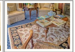
Comfortable accommodations are available five minutes away.