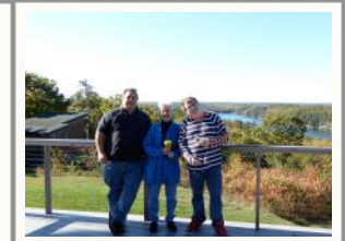
A beautiful deck allows for scenic relaxation time.

Participation fee payable to Friends of the DaPonte String Quartet: $375, due with application, refundable until Sept. 20.