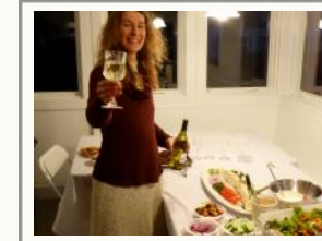
Terrific food catered by a favorite local restaurant.

The Cod Cove Inn, located in Edgecomb just off Route 1, and minutes from the lovely and scenic villages of Wiscasset, Boothbay and Damariscotta, offers accommodation at a discounted rate to participants on a first come, first-served basis, starting at $109/night. Reservations: (207)882-9586, mention DaPonte Workshop discount. Bring your spouse, who will enjoy exploring Maine’s stunning foliage and coastline while you are playing your heart out, just minutes away. The Inn is a five minute drive from the Deck House School.