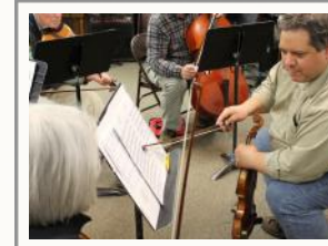
Each DSQ member will spend a few hours coaching each ensemble.

The workshop will begin on Friday evening with an introductory dinner for all. Coaching will be provided by individual members of the quartet in a round robin fashion throughout the weekend, along with a one-hour topical presentation and a mass ensemble reading of a great work on Saturday. The workshop concludes with an informal play-through of all the participants on Sunday afternoon.