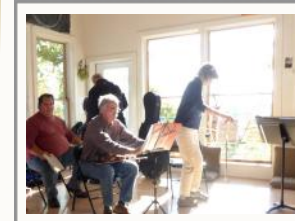
There are six comfortable rooms for rehearsal & group classes.

Located on an idyllic hill, overlooking the Sheepscot River, the Deck House School offers a secluded and comfortable setting to rehearse music. There are several rehearsal rooms, kitchen facilities and an outdoor deck. Meals for all participants will be catered by a popular local restaurant. Lodging is available for those who require it (see below) at reduced rates.